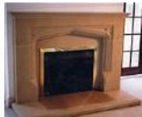
'Special to clients design'